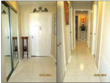
Foyer with mirrored closet doors