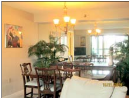
Dining room with mirrored wall