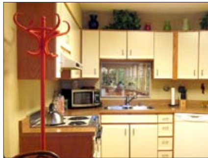
Lovely table space kitchen with pass through