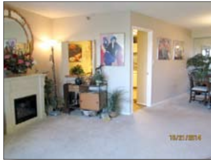
Living room with exit to balcony with stunning view