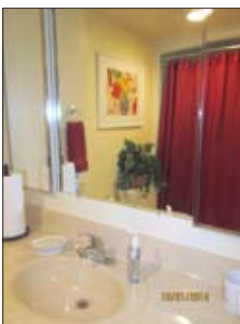
Second full bath